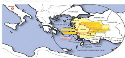
REVELATION: ROME & THE SEVEN CHURCHES